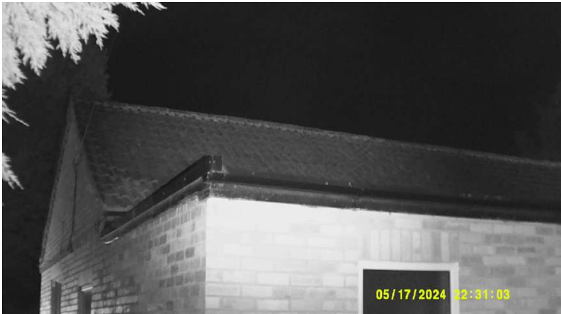
NVA northwest, end of survey