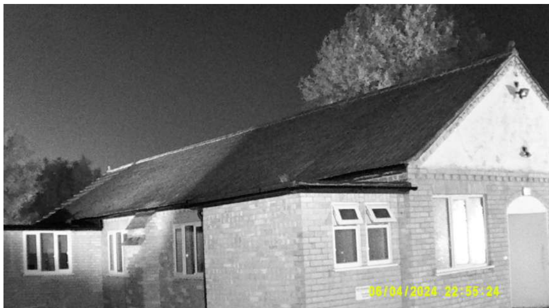
NVA southwest, end of survey