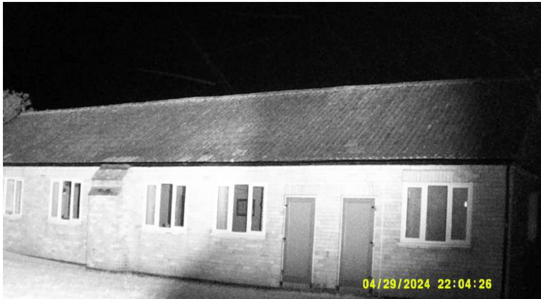
NVA northeast, end of survey