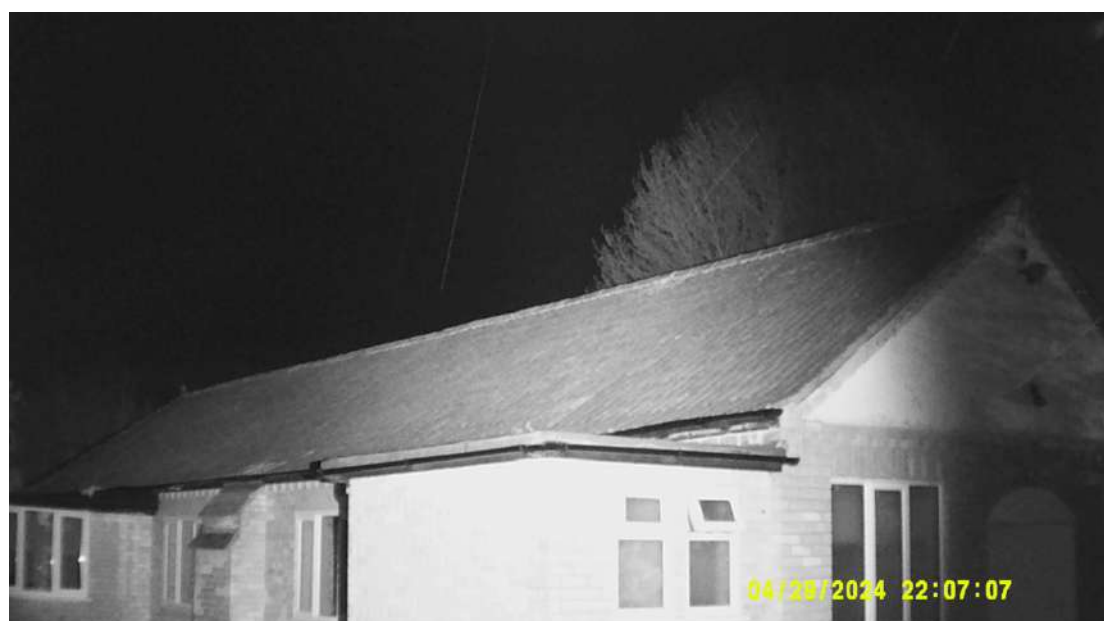
NVA southwest, end of survey