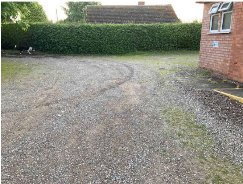
Photo 2. Gravel car parking to south of hall with native hedgerow along west boundary