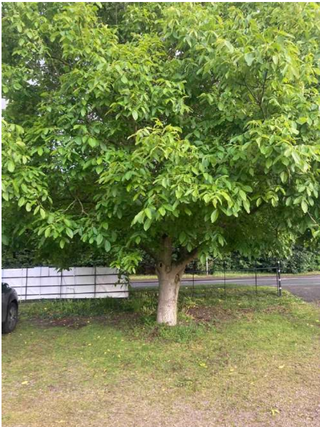
Photo 4. Walnut