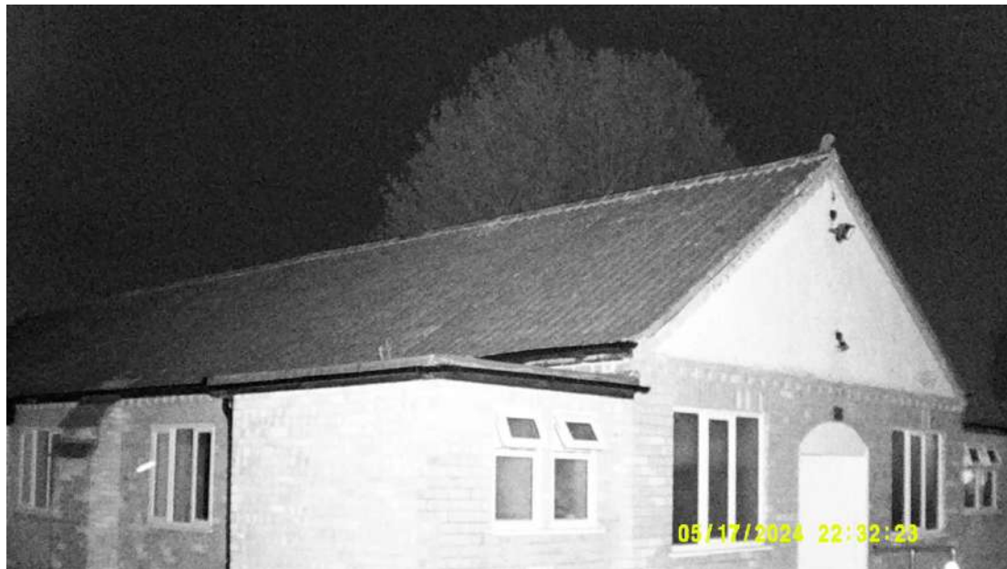
NVA southwest, end of survey