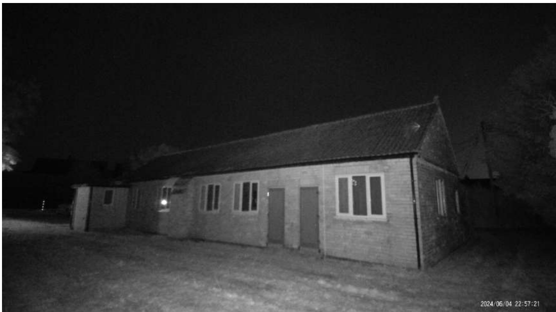
NVA northeast, end of survey