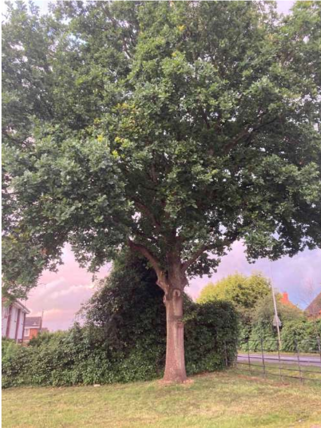
Photo 3. Pedunculate oak