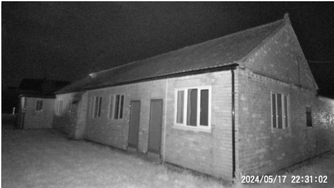
NVA northeast, end of survey