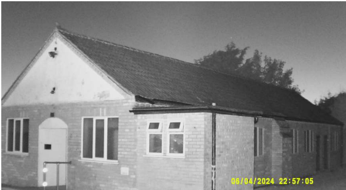
NVA southeast, end of survey